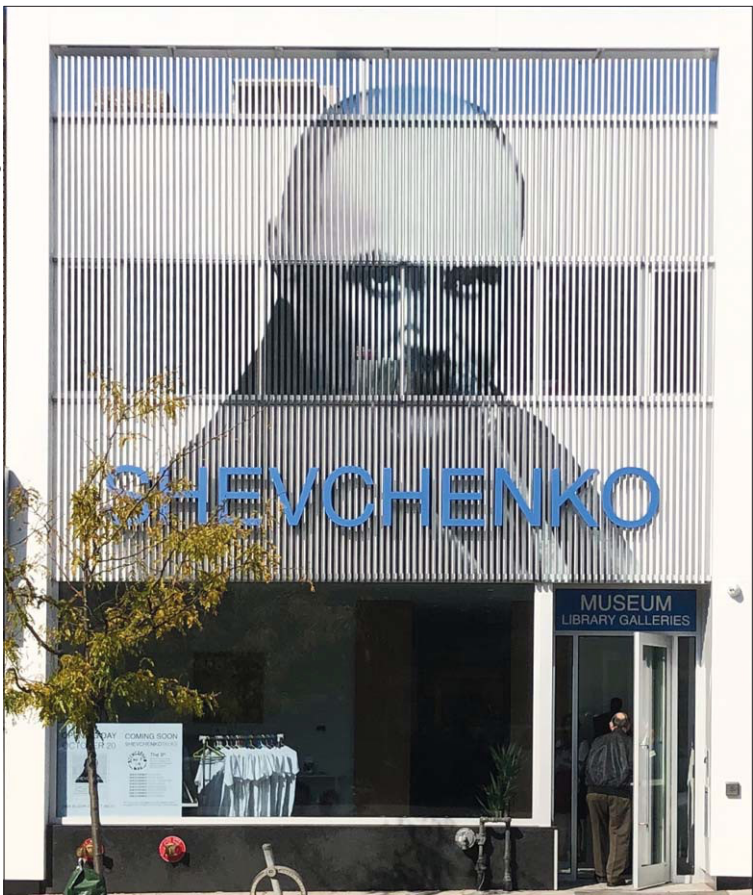
The neighbours were talking for months, wondering about the building shown above, with the big portrait on its facade — what was it all about? Perhaps some remembered the same building a year earlier, shown below. Many visited on October 20, while others have come by since.