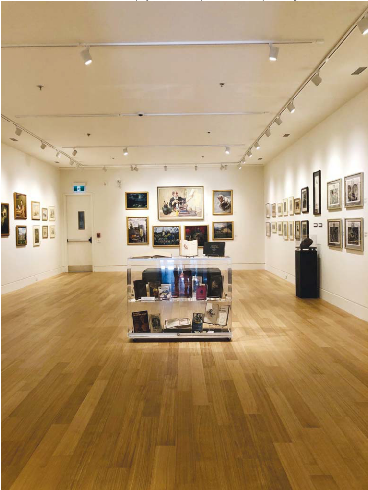
Outside and in, the building at 1604 Bloor Street West in Toronto has been transformed. Above is today’s display in the Shevchenko Gallery; below, the main hall of the AUUC Cultural Centre.